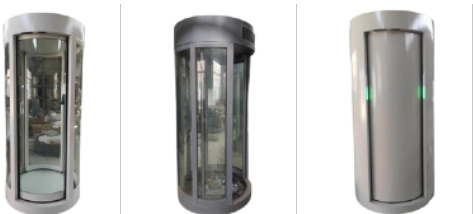
Other frame colors available, RAL or RGB required.