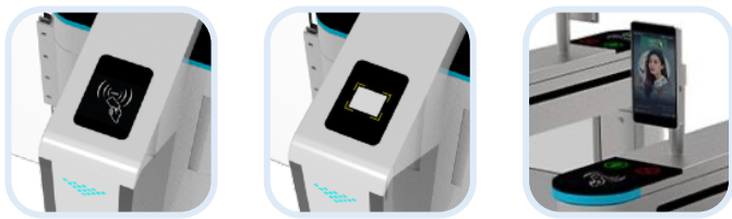
Cutouts can be customized to fit any reader.